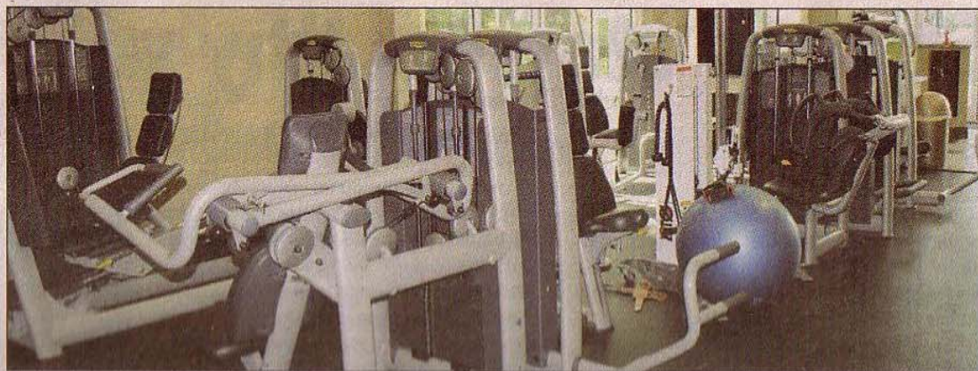
The gym offers a place to work out, personal training and classes such as max abs and cardio kickboxing.

"I learn approximately how much they ate and when," Nichols said. "It helps me to assess what they are doing and then go from there. Nutrition is 70 percent of any program whether it is for weight loss or to gain muscle. Most people will say they are doing pretty good but when you break it down you see that although they are making good choices, they need to be tweaked. Most of the time they just need a little bit of